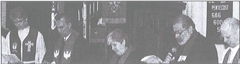
Service of Installation Greeting facilitated by Church and Ministry Chairpersons of the seven Associations