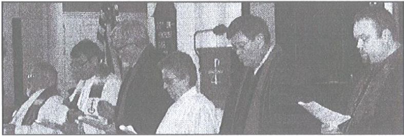
Service of Installation Prayers facilitated by the Moderators of the Seven Associations

We enjoyed a delicious lunch, fellowship with friends, and celebrated the 225th Anniversary of Tinicum UCC in Pipersville and the 275th Anniversary of Zion Blue Mountain UCC in Strausstown.