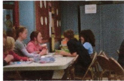
Children & Youth Ministries