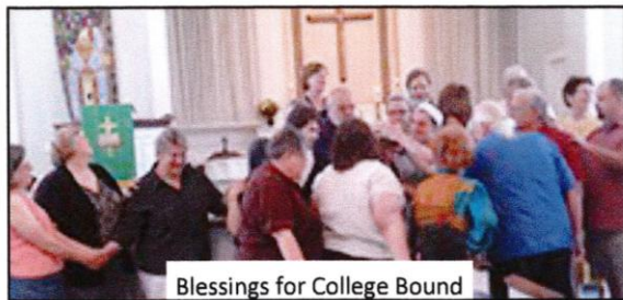
Blessings for College Bound

It takes vision and lots of prayer to start a church and the continue being the Church. The foremothers and forefathers of St. James United Church of Christ, Havertown did just that in 1944 when they began a church in the