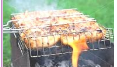
Happy Fathers Day